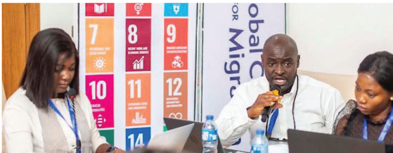
Migration moments with May

Additionally, during the proposal development process, youth-led organizations can be actively involved to contribute their perspectives, ensuring that initiatives effectively address youth-related concerns. This collaborative approach not only strengthens the outcomes of such projects but also empowers youth to see themselves as drivers of positive change. As John F. Kennedy aptly said, “Ask not what your country can do for you—ask what you can do for your country.”